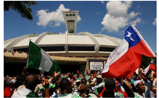
Major events held at the Olympic Stadium since its inauguration: